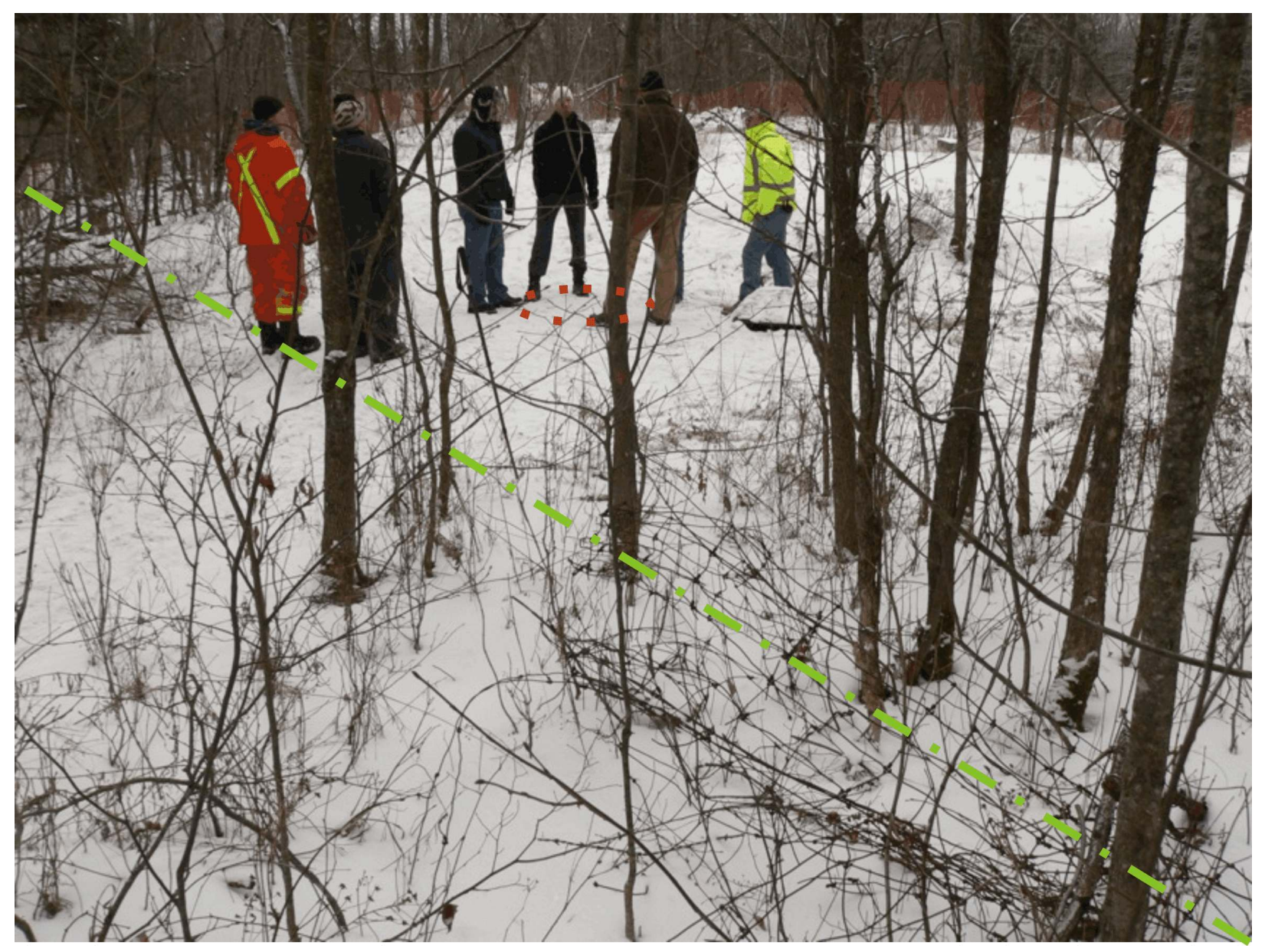
Figure 3 : Location of the stone circle (red dotted line) in relation to the fence line demarcating the division between the North and South halves of Lot 7, Concession 2, March Township. The remains of the wire fence can be seen in the foreground.